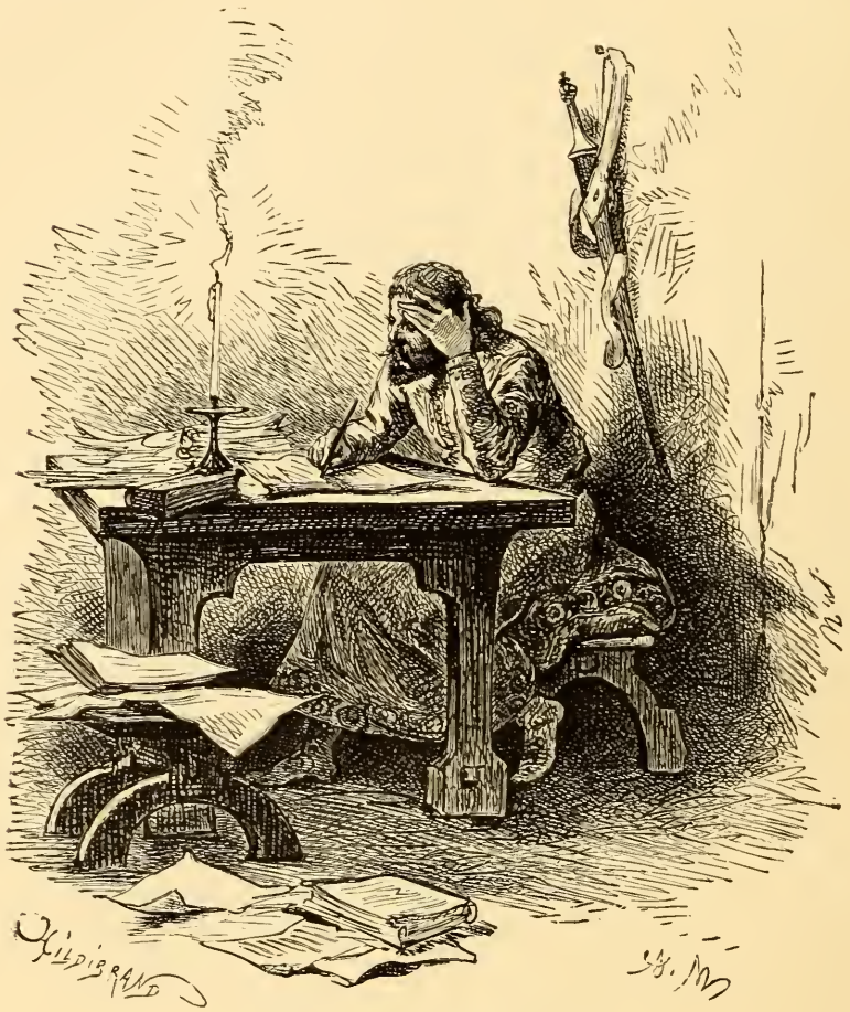
Alfred the Great in his study.